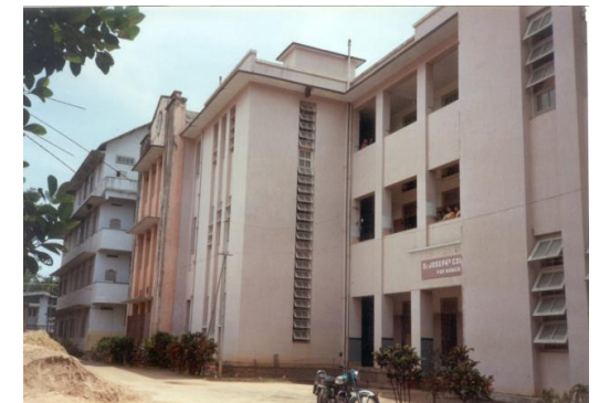
Alleppey - Università S. Giuseppe

To her was entrusted the task of establishing this institution. Blessed with the rarest gifts of heart and mind, she discharged her duties with the most ardent zeal, vigilance and breath of vision, so as to raise the University College rapidly to the highest level, securing for it a bright future, guaranteed by her protection from above.